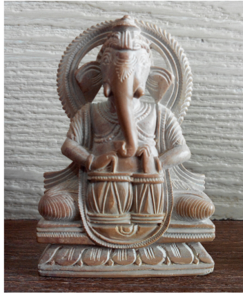
Tabla Musical Ganesha