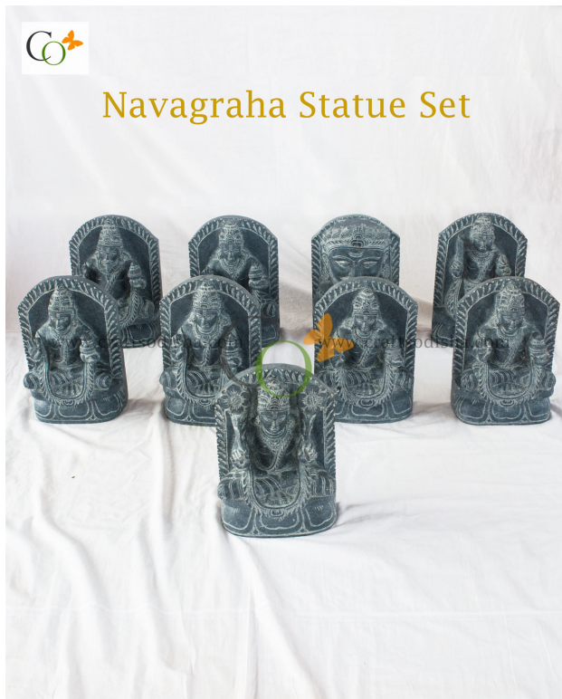
Navagraha Statue Set

with a humble eye define the desire and ego has to be under control, otherwise, it will distract and destroy the inner goodness. Devotees admire this form of Ganesha to achieve proficiency in dance. Widely worshiped by artists and dancers. His dancing idol helps to solve the financial problem and free you from debt-related issues. The idol wards off from evil eye and negative energies. It can be a beautiful decor for the garden, with the rare black finishing color. Placing: Consider west, north and northeast are the best directions to place the stone sculptures. The Ganesha statue should always face north direction. You can also place him in the entrance door, facing inside. Care: You can wipe the idol with a wet cloth or dry one. The stone can stand in any weather.