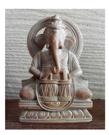
Tabla Musical Ganesha

The right hand is raised and facing upward in vitarka mudra. which depicts the uninterrupted flow of wisdom, there is another sign of the hand gesture, that is protection or shield, overcoming the fear. Left hand-held flat in the left knee in Dhyana mudra., palm face outward. This Buddha statue is also known as blessing Buddha, like Lord buddha showering his blessing. Must be kept in an area or room where you need positivity. Another option is at the entrance of your home, it helps to ward off all evil and negative energy from entering the house. Face him to the entrance. Placement : Place the Buddha statue in the area you want to cure Vaastu's defect. Care: Dusting can be done using a cloth or broom, enough to rid of accumulated dirt.